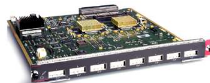
8 Port GBIC-Based Module

Designed to complement the many roles that the Cisco Catalyst 6500 Series plays in a network, Cisco Catalyst 6500 Series mixed media Gigabit Ethernet modules offer the broadest selection of media, densities, performance, interoperability, and chassis deployments for enterprises and service providers. These modules are ideal for gigabit Ethernet over fiber to the desktop, gigabit uplinks, aggregation of high-density 10/100 interfaces, Metro Ethernet, backbone and high-speed server farm or data center connections as well as mixed media environments supporting both fiber and copper cable connections. The Cisco Catalyst 6500 Series Gigabit Ethernet modules offer: