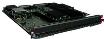
24 Port SFP-Based Module