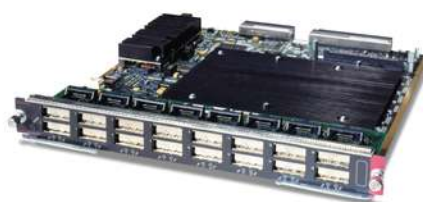
16 Port GBIC-Based Module